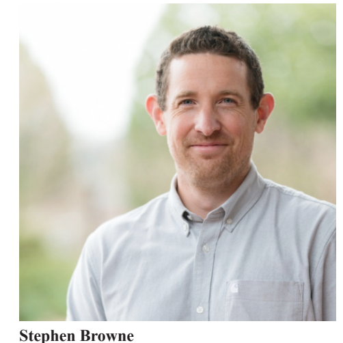
Autodesk Construction Solutions

see a maturation of the application into the project finances, for example around liquidity risk profiles of stakeholders, or even connections to commodity prices like iron ore to predict the price of steel, and combined with schedules be able to optimize the batching or JIT procurement of materials in a way that has a positive impact on bottom line and cashflow. Construction lives or dies by the bottom line, and that application of AI into the complex and multi-faceted world of project financials has the most to gain (literally and figuratively)."